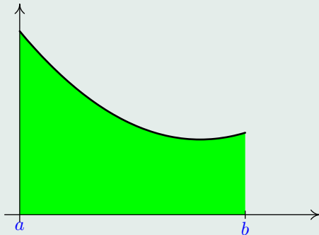
Figure 1: Floating figure